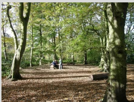
The beech wood now with seats