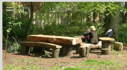
Good use was made of an old beech which had to be felled for safety reasons

In 2010 the ramp giving access to the wood from Lytham railway bridge was completely refurbished. The cost was over £6,000 but with grants and donations the Society's contribution was limited to £2,900.