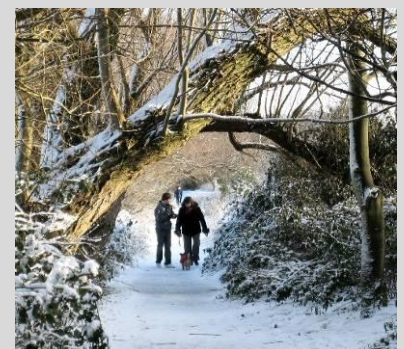
Summer or winter, we have an attractive and popular woodland walk